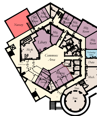
Lower Level Plan