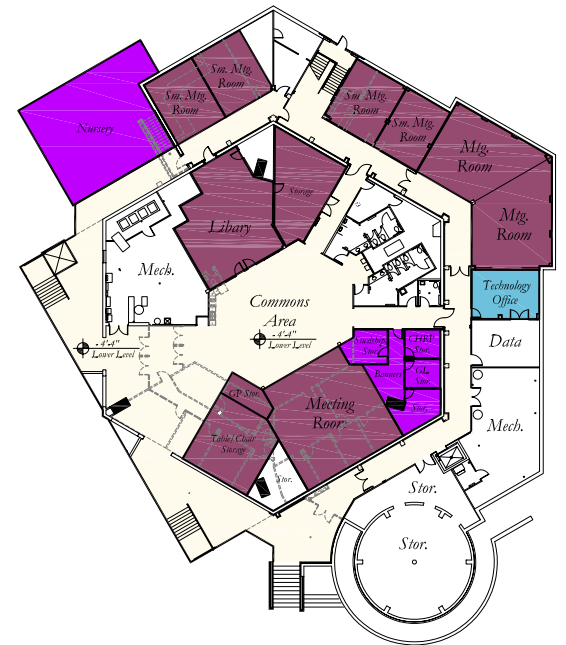
Lower Level Church Plan